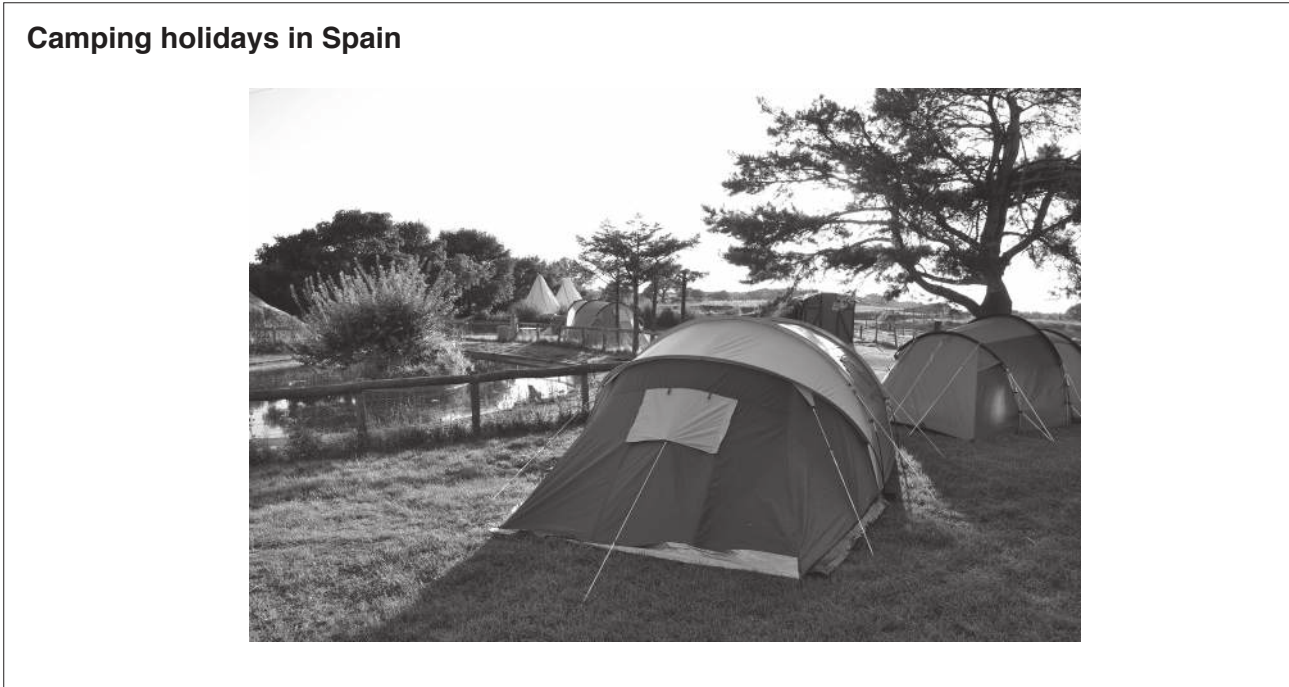
Fig. 4 for Question 4

The Catalonia region of Spain is popular with campers, with its Mediterranean climate and a variety of attractions nearby, including the historic city of Barcelona. Camping offers an affordable holiday, with low accommodation costs and no set itinerary to follow. Visitors wishing to camp can either bring their own tents and other camping equipment with them, or they can hire fully equipped tents for up to 8 people. Campers can choose whether to enjoy the fun of cooking for themselves outdoors, or to visit a nearby town to enjoy the local food at a restaurant, according to their budget. Many tourists camp during the summer months but some campsites have few visitors for the rest of the year.